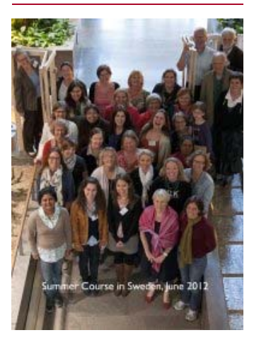
GEDS' Summer Institute in Jönköping, Sweden, 2012.

cecilia.allegrind@hlk.hj.se 036-10 13 76